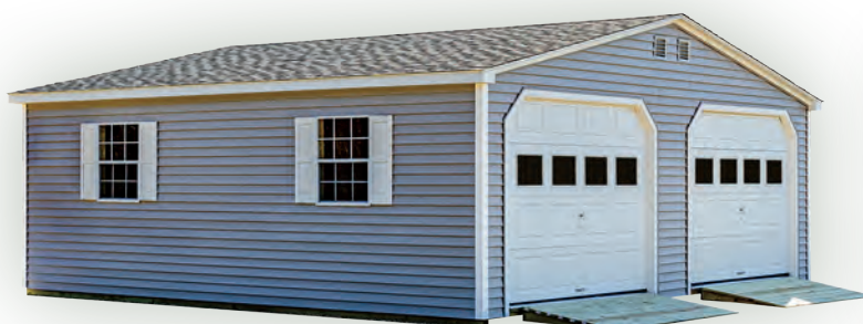
24'x24' with two 9x7 garage doors