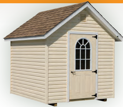
Shown with optional 11-lite glass in doors