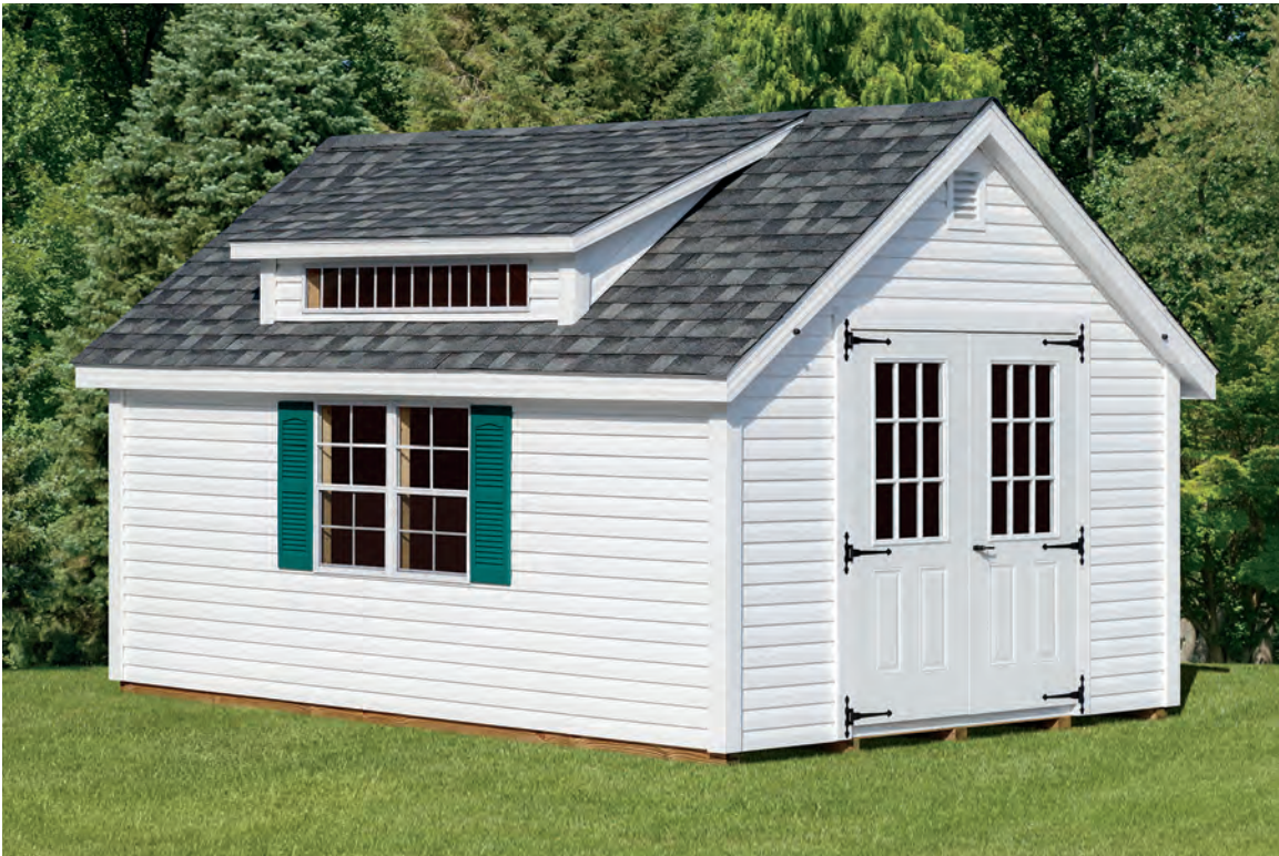
Shown with optional 9-lite doors