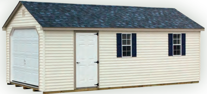
Picture below is showing a 9x7 carriage style garage door with Stockton window grids