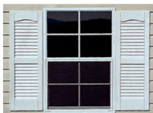
Large Window 24" x 36" Small Shutters Large Shutters