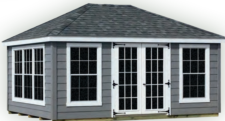
Optional hip roof or a-frame roof