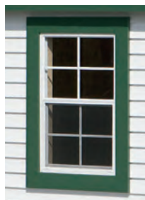
3½" Window Trim