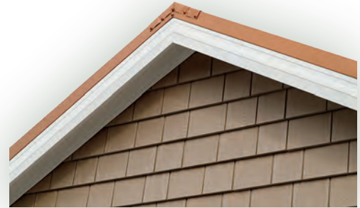
Optional metal roof and vinyl shake siding