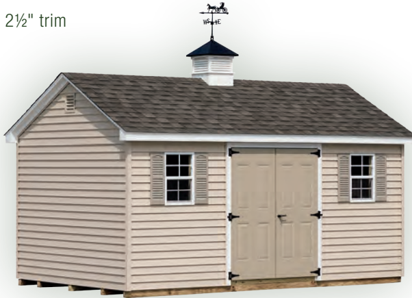
Shown with optional cupola and weather vane