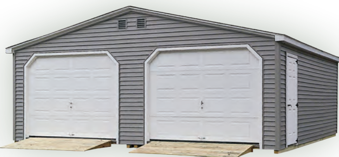
Featuring a 24'x30' with two 9x7 garage doors