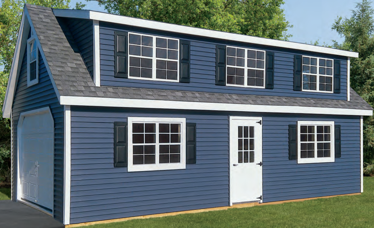
Shown with 26' Pent Roof