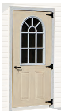
Arched Glass Inserts in Door