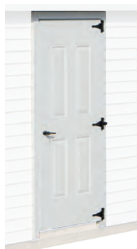
Single 3 Door