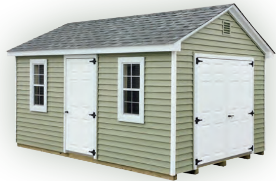
Shown with optional extra man door