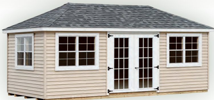
Shown with optional 15-lite glass in doors