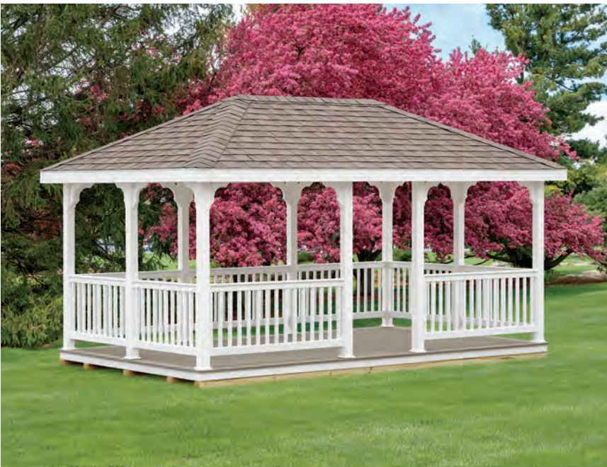
Hip Roof Cabana