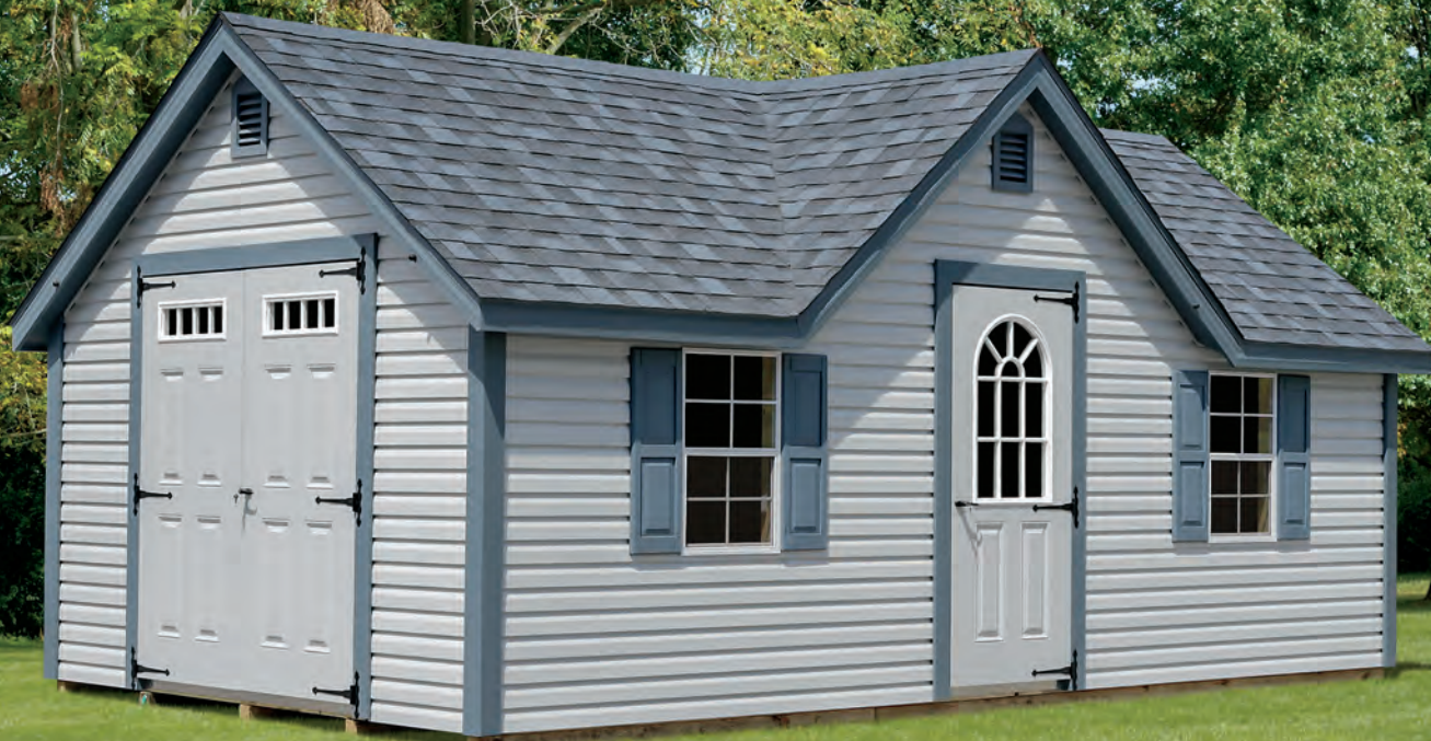
Shown with optional reverse gable dormer