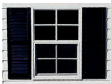
Small Window 18" x 27"