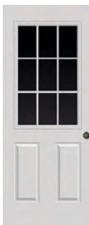
9 Lite Glass Inserts in Door