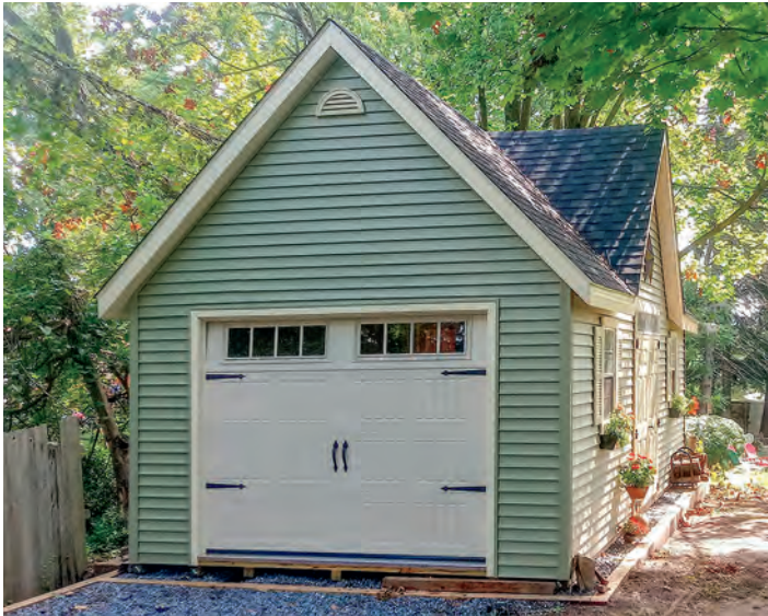
Shown with reverse gable