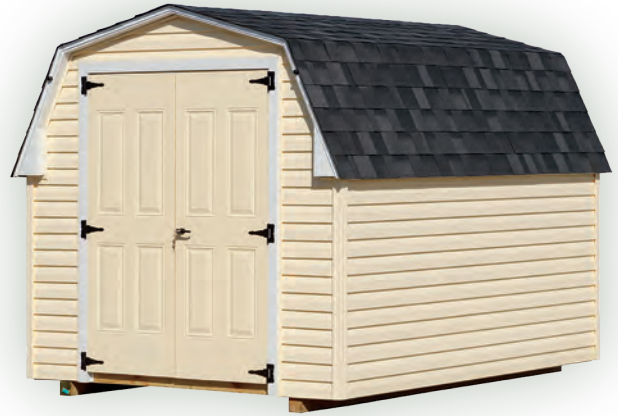
Mini barn with 4' walls