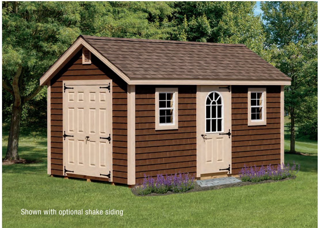
Shown with optional shake siding

Add the New England Series trim package to any size or style of shed for a stunning combination of style and class!