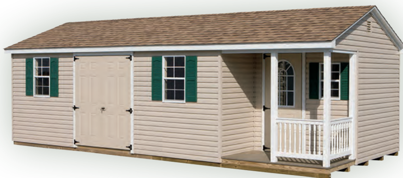
Shown with optional 4'x8' porch and 11-lite glass in porch door