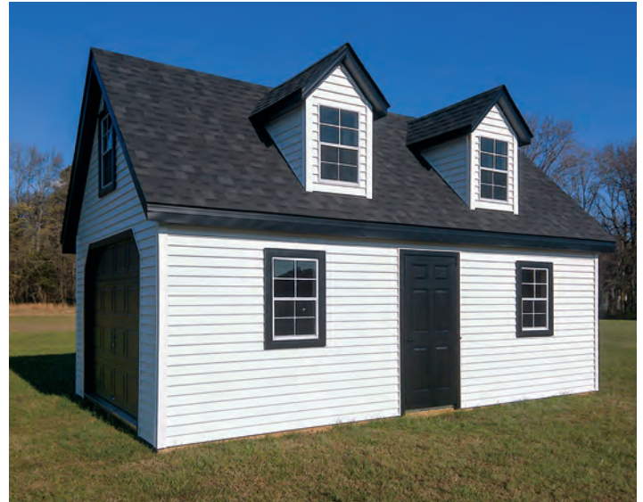
Shown with two house dormers