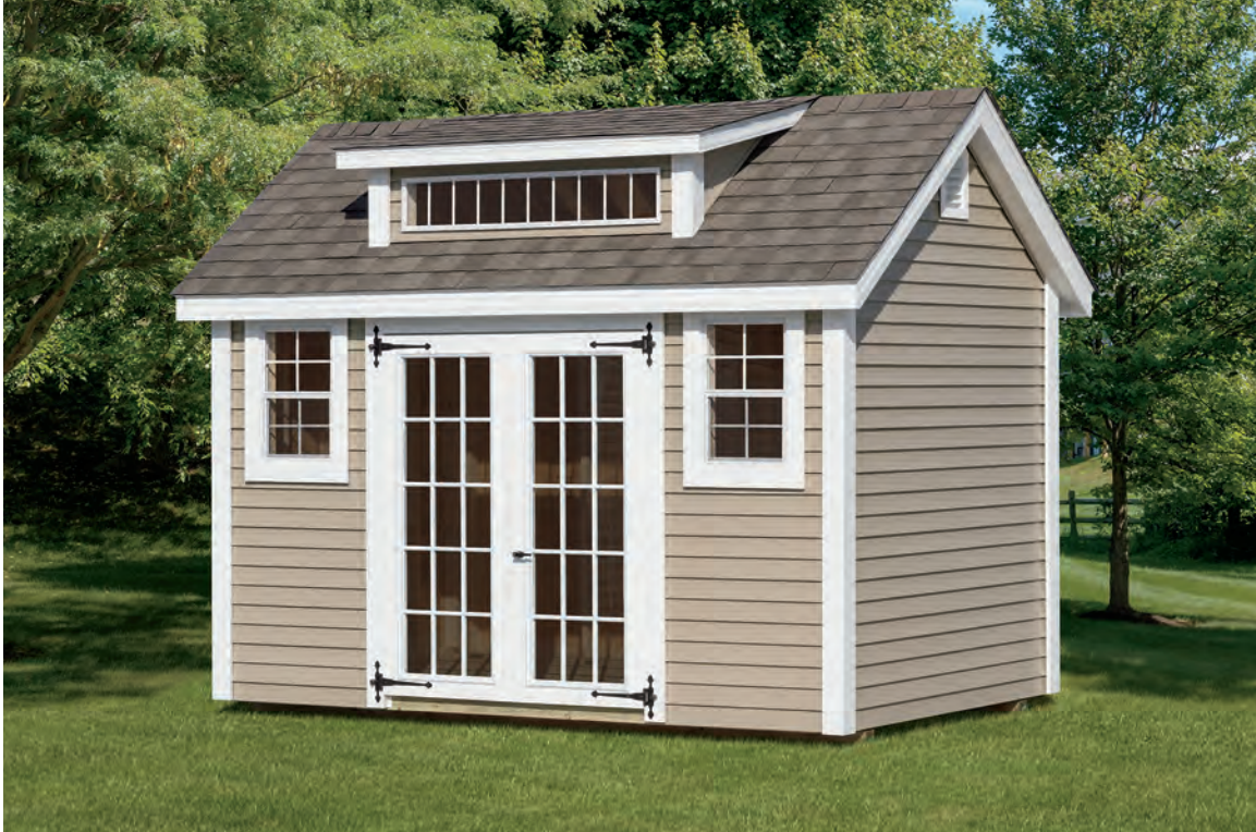
Shown with optional full glass doors