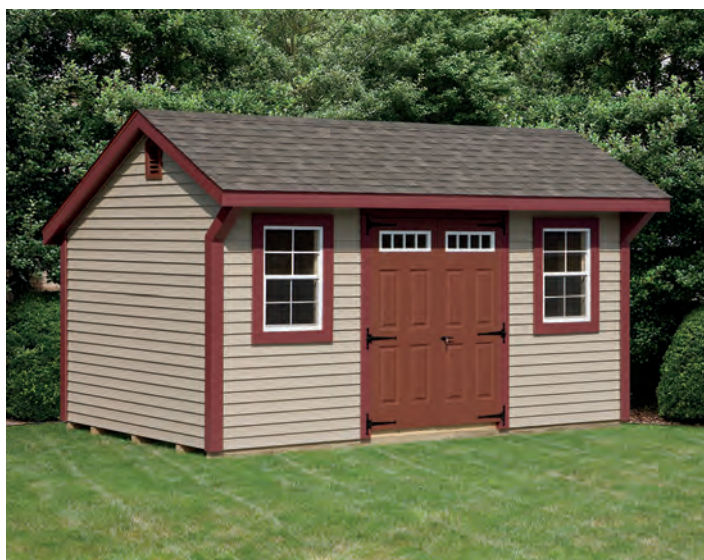
New England Quaker