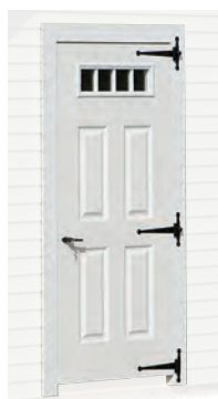
4 Lite Glass Inserts in Door