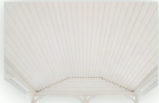
Vinyl cathedral ceiling