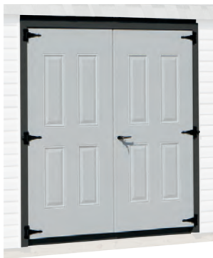
Extra Double Door