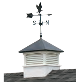
18" and 24"