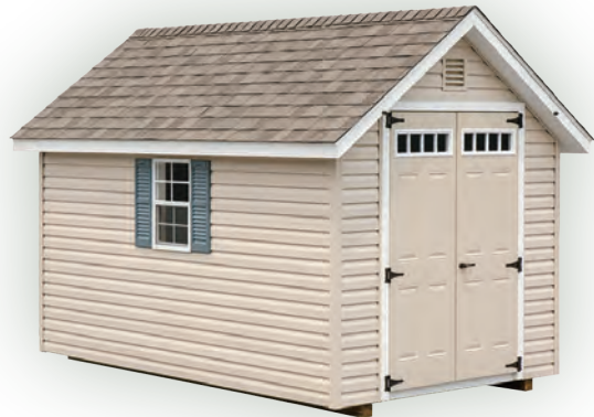
Shown with optional transom window doors