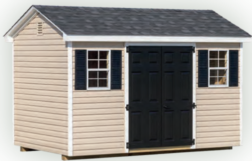
Shown with painted doors and white corners