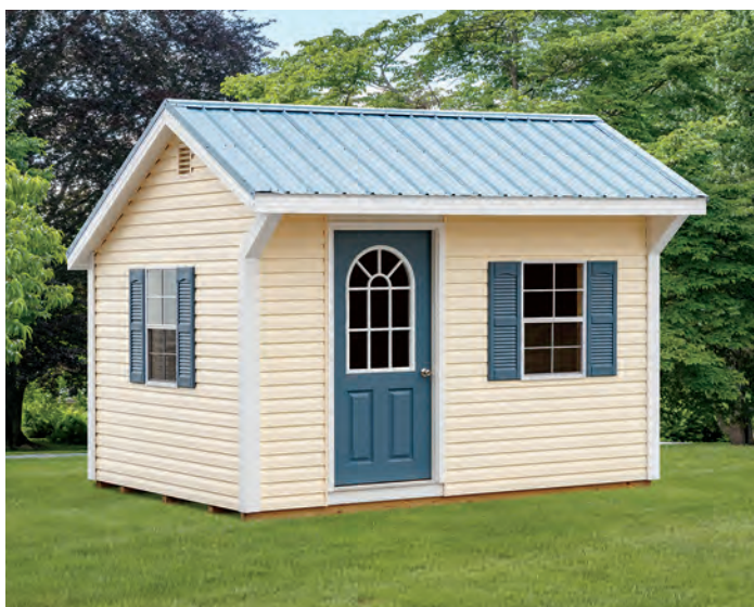
New England Quaker shown with optional metal roof