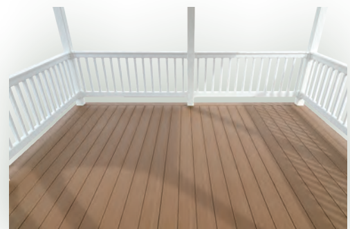
Evergrain decking • Lifetime warranty

Weight bearing PVC posts and rails, available in two colors, clay or white