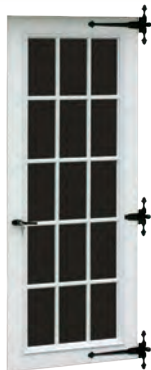
15 Lite Glass Inserts in Door